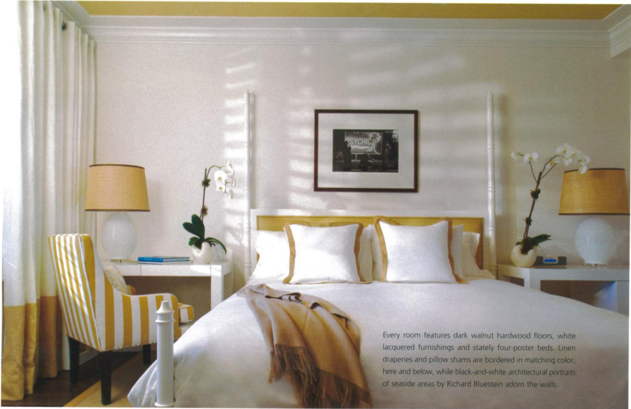
Every room features dark walnut hardwood floors, white lacquered furnishings and stately four-poster beds. Linen draperies and pillow shams are bordered in matching color, here and below, while black-and-white architectural portraits of seaside areas by Richard Bluestein adorn the walls.

Offering luxury amenities and the latest technology, each room features Frette linens, plush robes and slippers, and fresh orchids. High-tech amenities include high-speed Internet, an iPod docking station, LG plasma TVs and a DVD/CD player. Luxurious baths wrapped in marble continue the modernity with spacious walk-in showers and bespoke design vanities. Mirrors incorporate high-definition LCD TVs and simulate natural light. Malin+Goetz luxury apothecary products boast modern hydration technologies and natural botanical extracts.