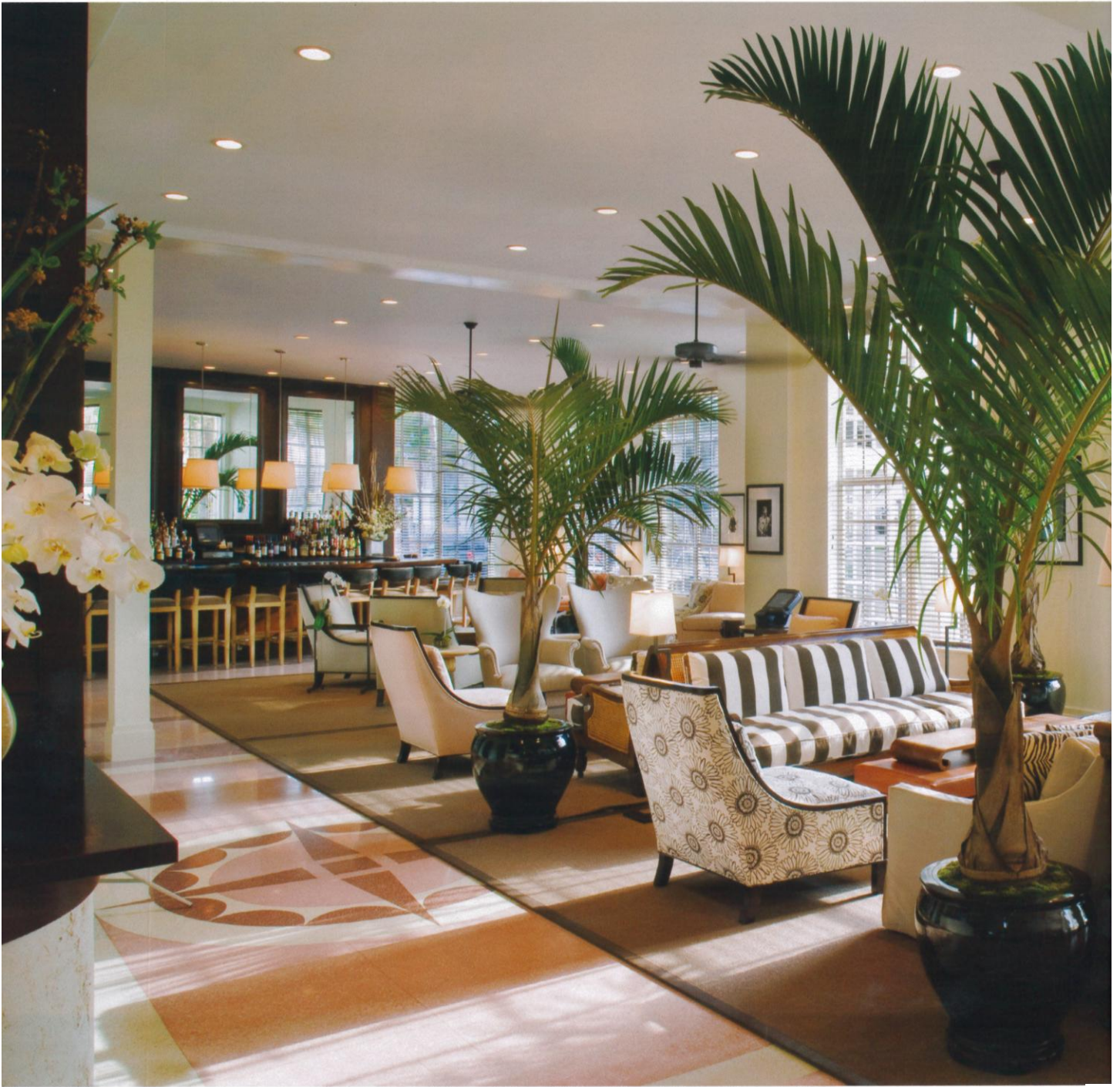
ABOVE: Floor-to-ceiling windows allow light to flow into The Betsy hotel's bright and airy lobby, where tropical colonial decor prevails, echoing the regal estate-like look of the exterior, above right. Dark wood, whirling fans, plantation-style shutters, potted plants, and comfortable yet stylish furnishings add an Old World feel to the space.