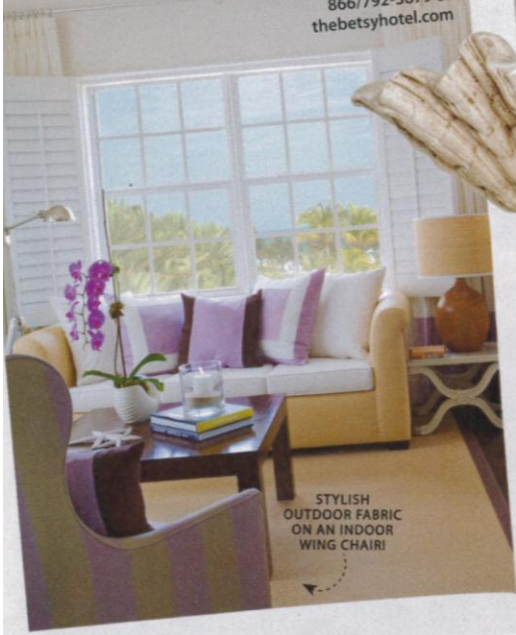
STYLISH OUTDOOR FABRIC ON AN INDOOR WING CHAIR!

The Betsy Hotel, South Beach, Miami, Florida (rates from $400 per night); 866/792-3879 or thebetsyhotel.com