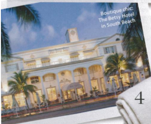
Boutique chic: The Betsy Hotel in South Beach

8 Silver Resin Whelk Shell , $28, Lazy Susan; 888/578-7288 or lazysusanusa.com >