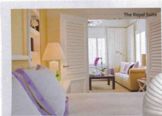
The Royal Suite

1 Juicy Jute Grasscloth wallcovering in Purple Passion, Nonchalant White, and Biscuit, Phillip Jeffries Ltd.; 800/576-5455 or phillipjeffries.com for ordering info