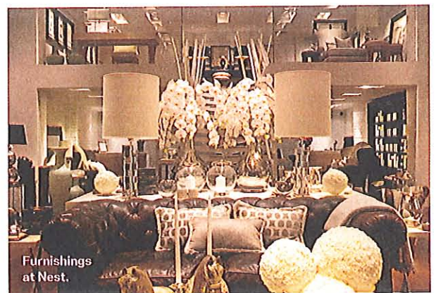
Furnishings at Nest.