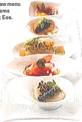
Raw menu items at Eos.