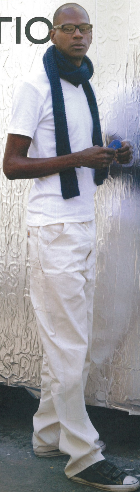
Mark Bradford outside his Los Angeles studio with his work You Wear Your Pants Too Tight, 2010. See page 70