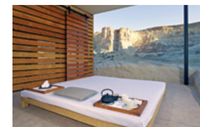
Amangiri sits on 600 acres

Edition The deLuxe supplies guests with Twister, which doesn't work waistlines like the Edition's in-house bikini boot camp.