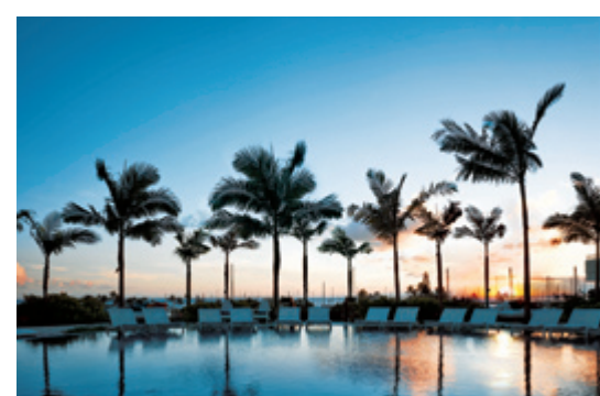
The Edition offers guests poolside iPads