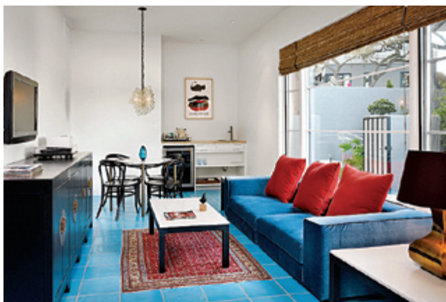
The Saint Cecilia stocks caviar in the minibar

The Jefferson The Surrey's roof garden overlooks Central Park. The Jefferson's spa offers treatments with botanicals from Thomas Jefferson's Monticello garden.