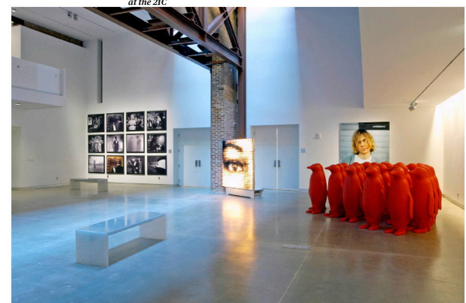
Exhibitions rotate every six months at the 21C

21C The height of boutiquey-ness is exemplified in the 21C's waterfall urinal that doubles as a one-way mirror into the lobby. And its 42 four-foot-tall recycled-plastic penguins, which were shown at the 2005 Venice Biennale. Their current purpose remains unclear.