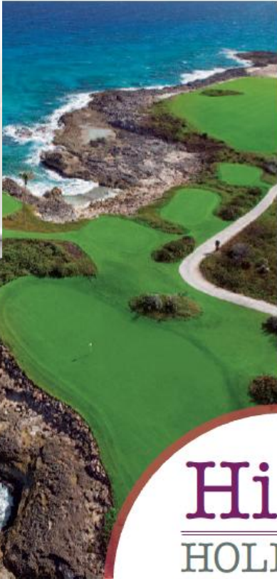
SEASIDE LINKS IN EXUMA