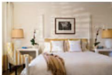
THE BETSY HOTEL

When shopping South Beach, there's always Lincoln Road where you will find anything and everything among its myriad shops and casual cafés. For something that is decidedly more boutique, look for labels like Céline, Balmain and Lanvin at The Webster (the webstermiami.com ). If vintage is your thing, hit C. Madeleine's ( cmadeleines.com ).