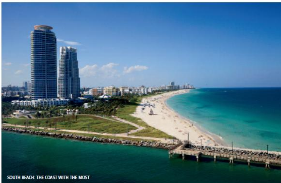
SOUTH BEACH: THE COAST WITH THE MOST