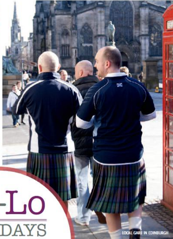
LOCAL GARB IN EDINBURGH