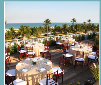
ROOF DECK EVENT SETUP

The Betsy – South Beach is the perfect location for production. Our team will make your shoot perfect in every way – whether you're doing a small catalogue, editorial shoot, press jacket, or major film.