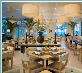
BLT STEAK 100 SEATS