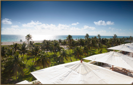
THE DECK 3,750 SQ. FT.

PERFECT LOCATION | GROUP RATES | FREE WIRELESS | BUSINESS CENTER GREAT FOOD | VALET PARKING | ADAPTABLE SPACES