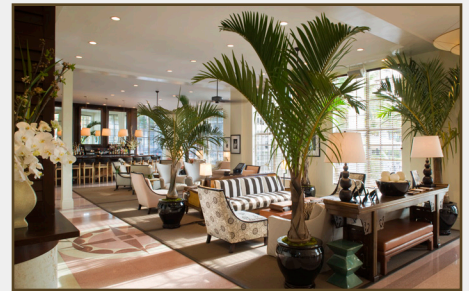
LOBBY SALON W/ BAR EXTENDS TO BLT