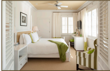
63 GUEST ROOMS INCLUDING SUITES