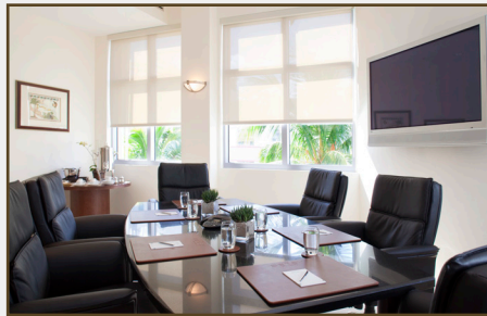
2 PRODUCTION OFFICES 150 & 550 SQ. FT.