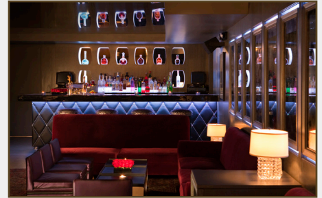
B BAR 1,100 SQ. FT.