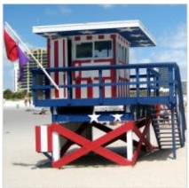
The glitz of Miami's famous South Beach stretches to the beach huts View gallery (total of 4 images)