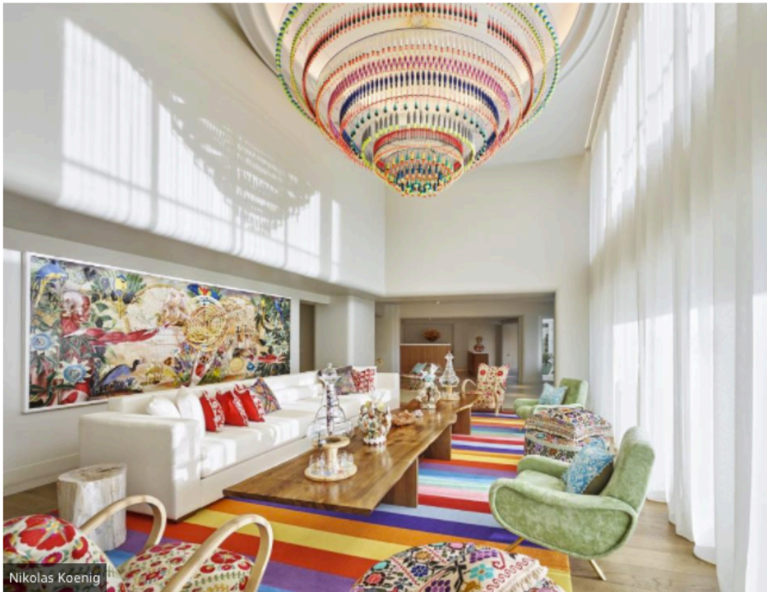
Tierra Santa Healing House at Faena Hotel Miami Beach is a colorful, yet soothing oasis.

Whatever your reason for visiting Miami – the year-round tropical climate, world class dining and shopping, flourishing art scene (or all of the above) – it doesn't take much for the Magic City's extravagant and indulgent ways to catch up and slow you down. And as lovely as the city's sandy beaches are, oftentimes they're swarmed with people – making them far from relaxing.