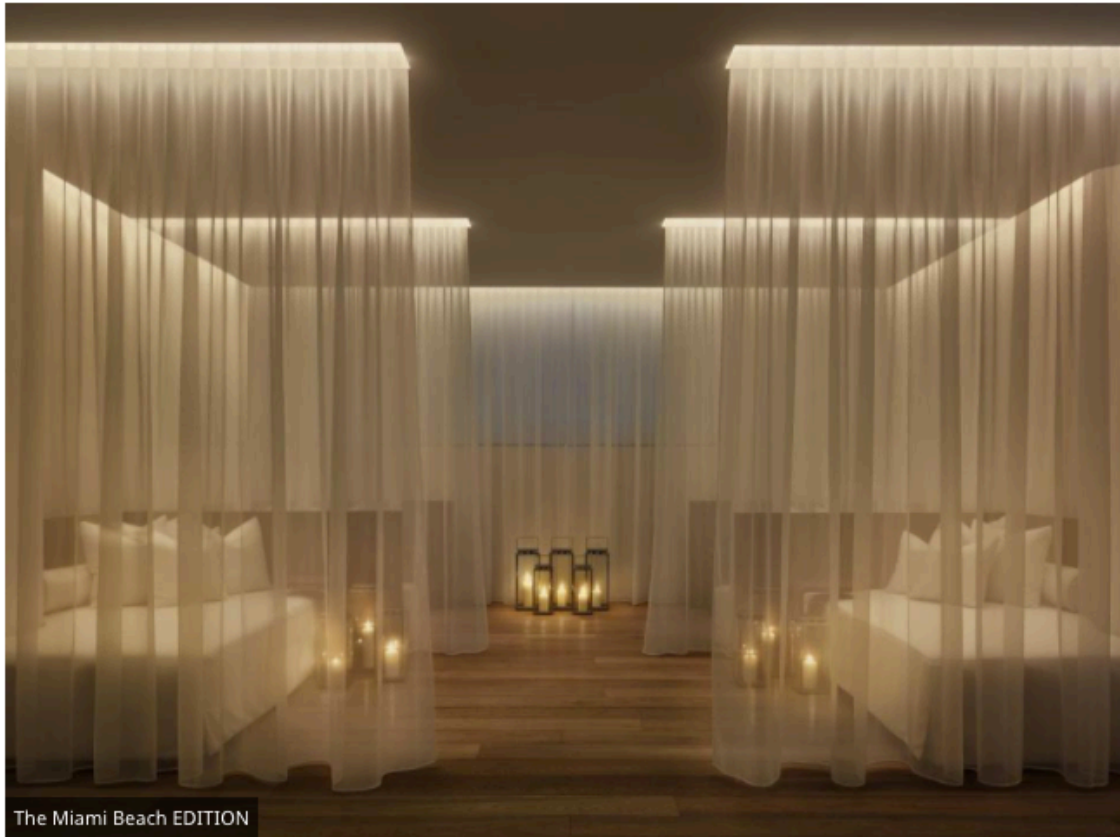
The Miami Beach EDITION

The lounge at The Spa at The Miami Beach EDITION maintains a relaxed vibe with gauzy drapes and candles.