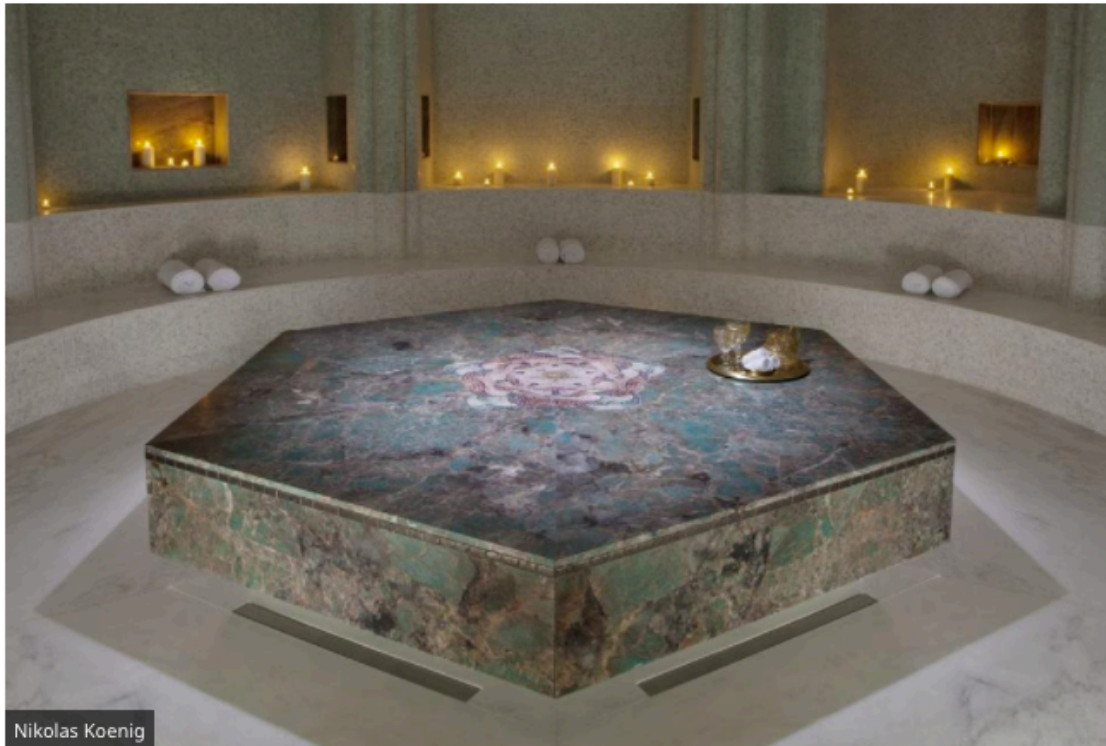
Even the famed wet spa and hammam at Tierra Santa Healing House is a stunner, with its aqua and pink hexagon platform of heated Amazonite. Given the brand's roots in South America, many of the treatments honor the region by using indigenous ingredients like stones, herbs, and oils. For example: during my treatment (called Tree of Life Vibrations), my therapist incorporated a proprietary blend of oils and Brazilian rose stones to gently wake up my entire body with massage, from my toes to my scalp. My session ended with singing bowls. They were strategically placed on my back, then tapped to release relaxing sounds and vibrations.