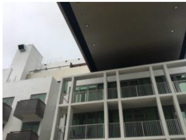
Looking up from underneath the pool

It is always a delight to be intellectually stimulated in, and by, a luxury hotel that has enough personality for several lifetimes, and Miami's The Betsy, South Beach, fits that description. Not only has it been, since its opening in 2009, a unique house of creativity, with almost-weekly resident artists and writers staying inhouse, but now it has more than doubled in size and offerings. Look above, and to the left, at its new pool, cantilevered as an airbridge on ninth floor rooftop from the original Betsy, to its now-conjoined sibling, The Carlton.