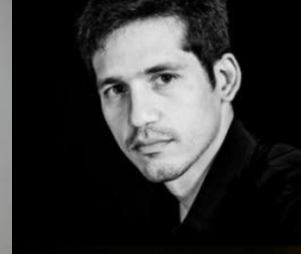
Carlos Andres Cruz (Colombia) Photographer